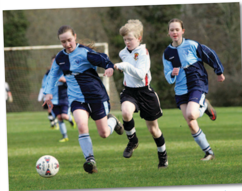
Check out this mixed game in Northern Ireland!