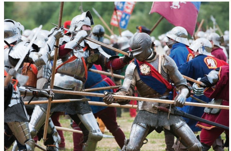
People today acting out one of the battles from that time.

To a time when two men fought each other in a muddy field for the honour of being called "King of England".