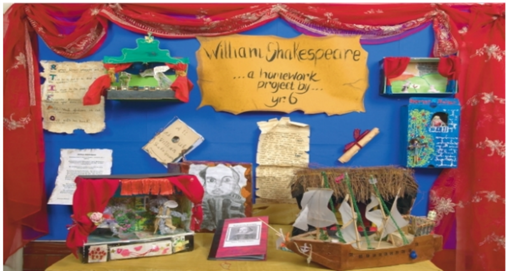
A Shakespeare Story Box created by a group of Year 6 pupils.