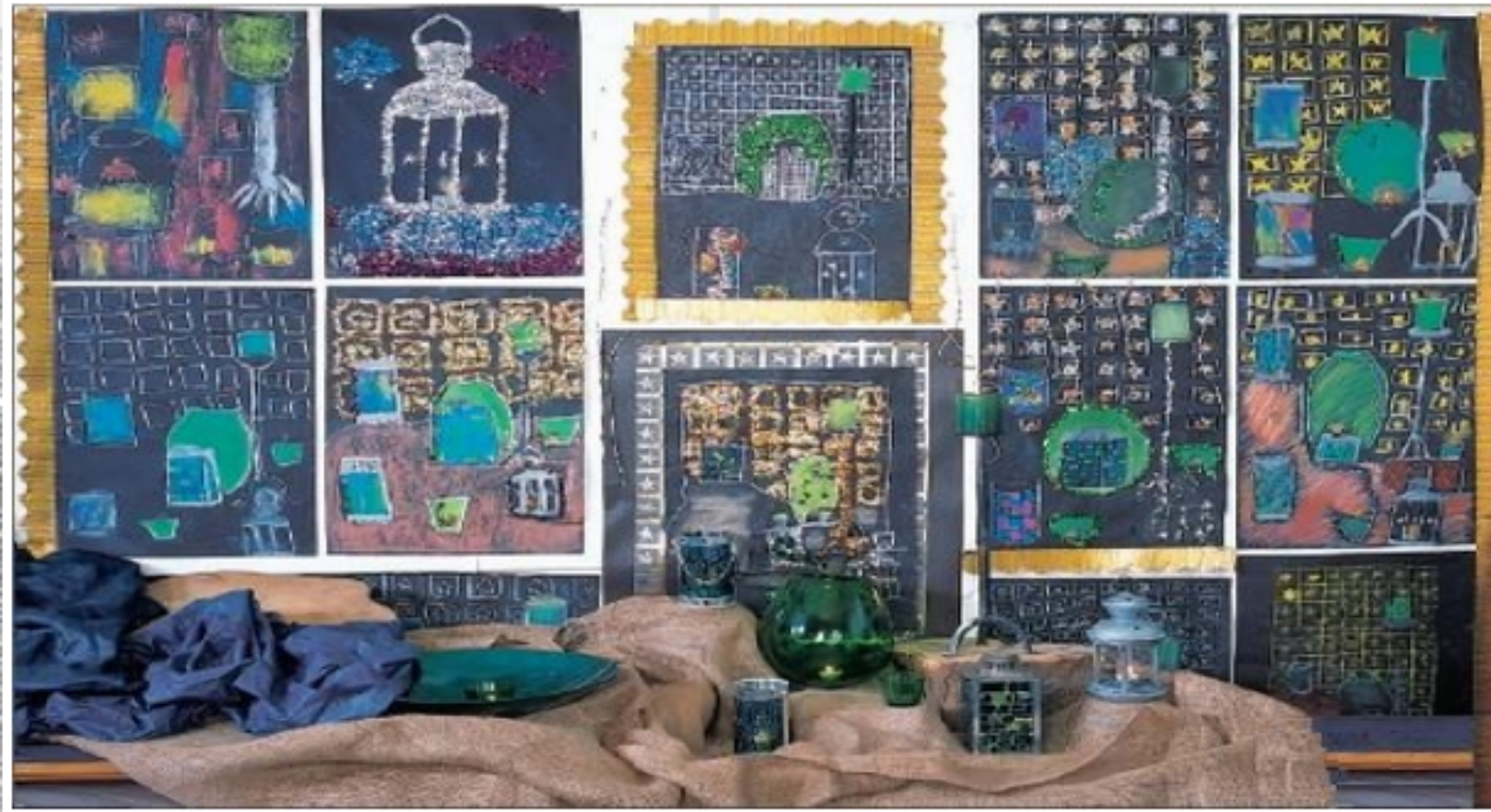
A display of Diwali lights and painted lanterns