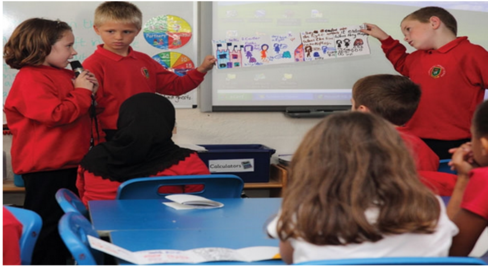
Making Story Strips 1