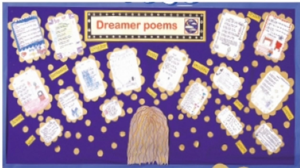
A display of dreamer poems