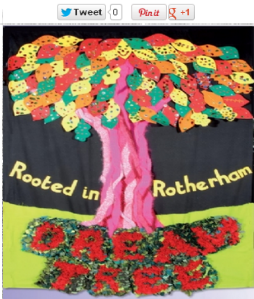
A dream tree wall hanging made by pupils in Rotherham

To work as a group to plan and create a piece of community art.