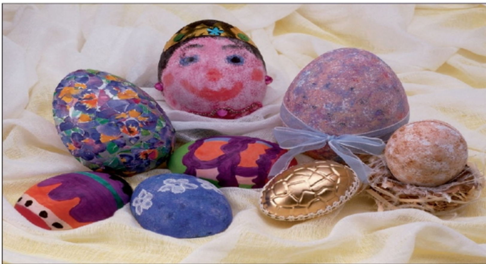
Plaster Easter eggs, decorated in a range of styles