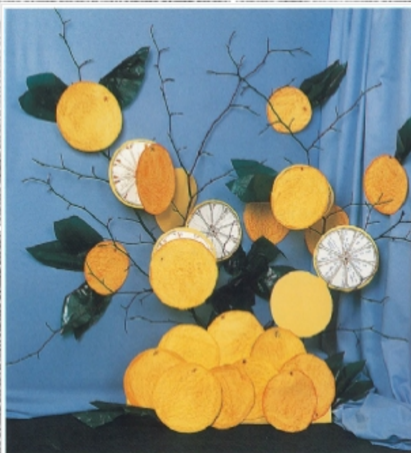
An orange tree display of citrus poems