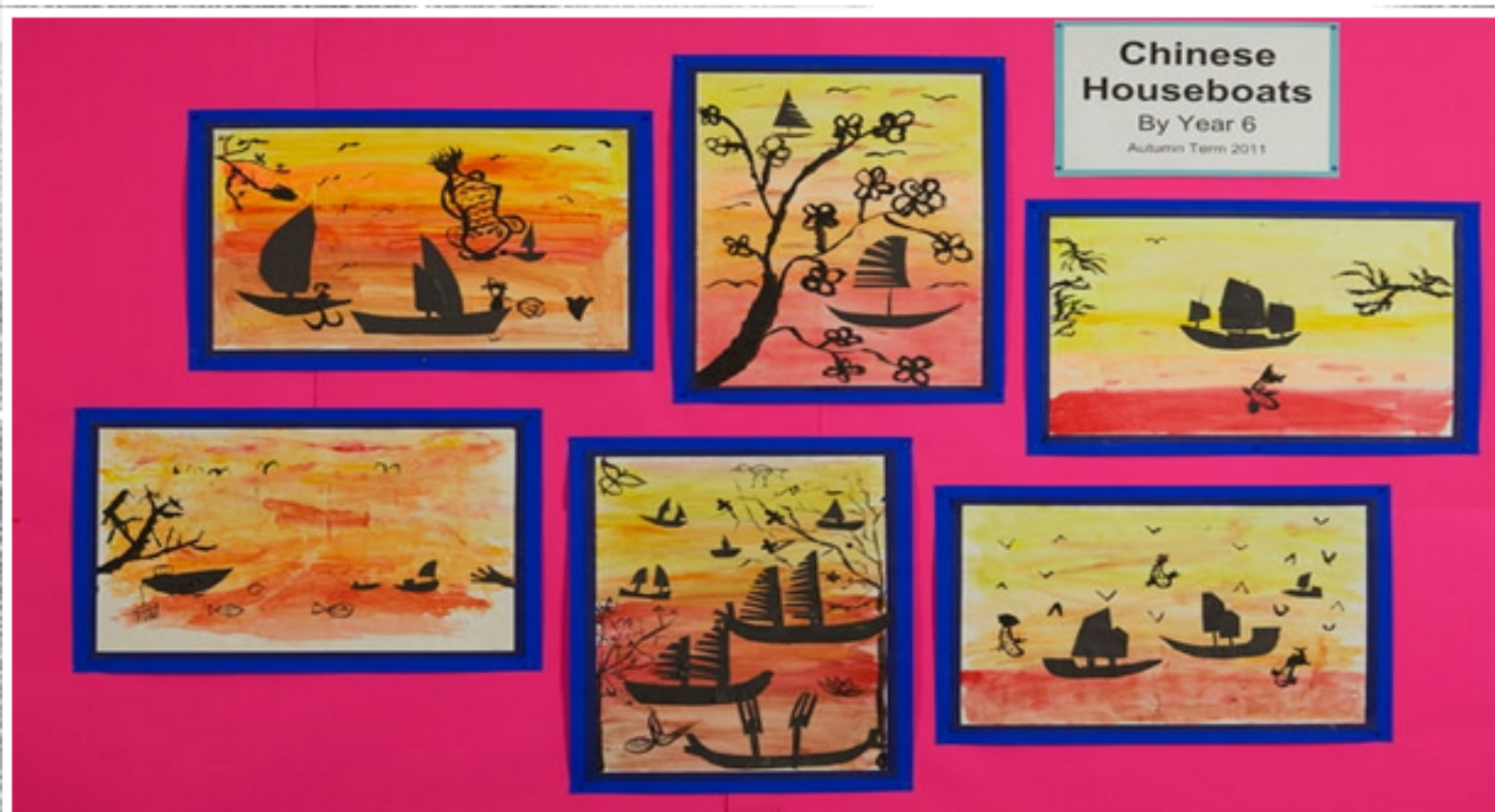
Chinese Houseboats by Year 6