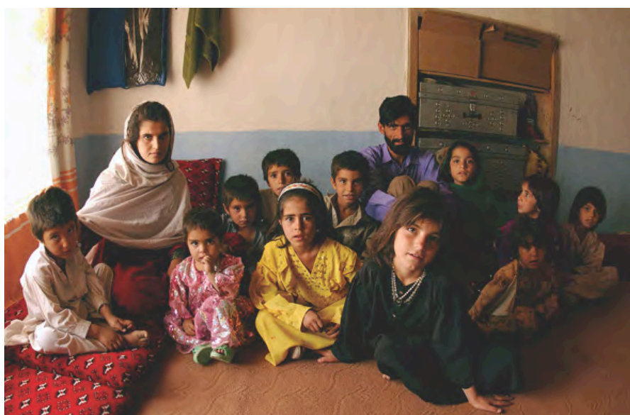
Image 1.1 An Afghan family at home