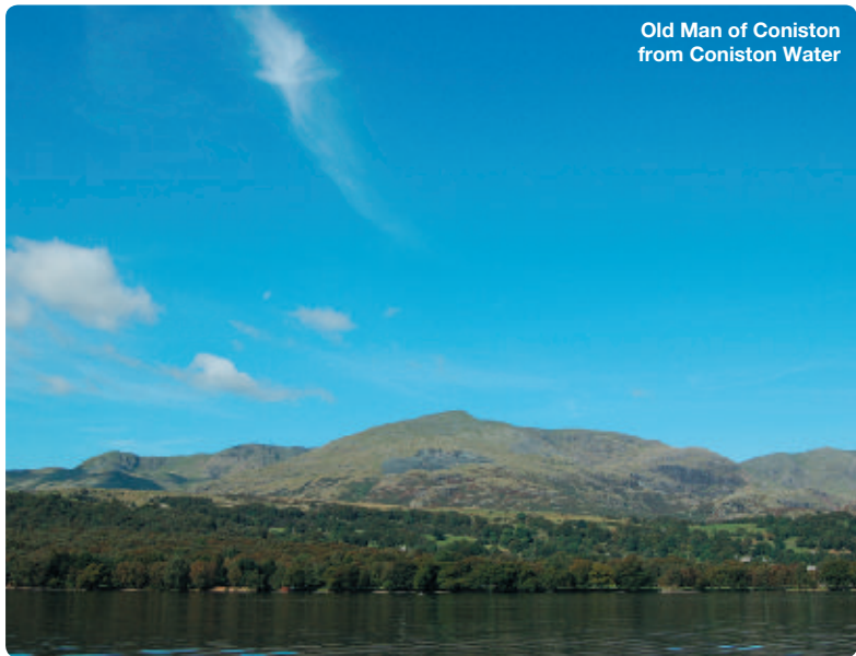
Old Man of Coniston from Coniston Water

K Turn right onto the road with great care as it is a blind corner here. Follow the road a short distance back to the car park.