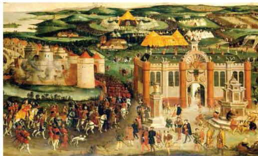
'The Field of the Cloth of Gold', painted for Henry VIII in 1545. Can you spot the king on his horse?

Henry was reluctant to let go of his ambitions. To make peace seem more honourable, Wolsey organised a magnificent peace conference, and on 6 June 1520, the two young kings met in France. For two weeks they tried to outdo each other with displays of wealth and flamboyance, jousting, feasting, playing games and throwing parties. Henry and Francis even met each other in the wrestling ring, where Francis I won, much to Henry's anger. The meeting was called the 'Field of the Cloth of Gold'.