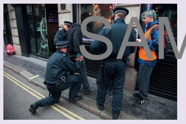
A protester being stopped and searched in London before a G8 summit

In the last ten years, the government has created 3,000 new criminal offences, adding to a compendium of 8,000 existing offences.