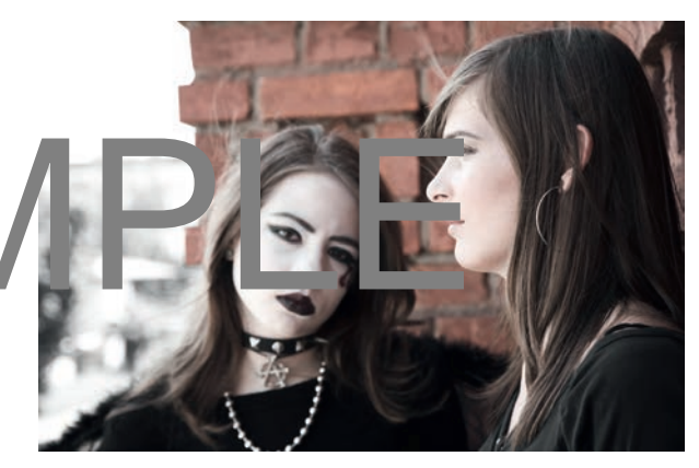
Deviant values are less important to many neo-tribes than individuality.

for the existence of neo-tribes. Maffesoli was unhappy with the idea that subcultures were stable and clearly defined groups whose members all shared very similar values. He suggested that it was much better to think of subcultures in terms of "fluidity, occasional gatherings and dispersal". Neo-tribes then referred more to states of mind and lifestyles that were very flexible, open and changing. Deviant values are less important than a stress on consumption, suitably fashionable behaviour and individual identity that can change rapidly. The shift towards this sort of grouping implies that, rather than subcultures strongly committed to criminal activity, there are only neo-tribes which are more likely to be involved in occasional mildly deviant behaviour.