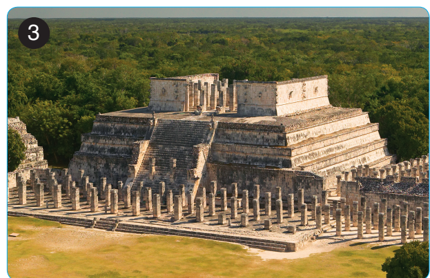
▲ The Maya Indians built this pyramid in the Mexican rainforest 3000 years ago.