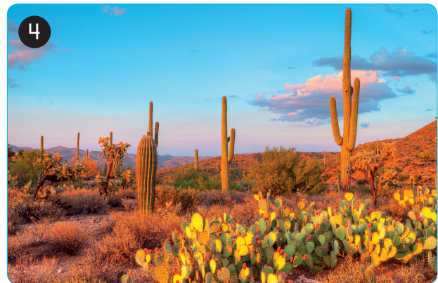
▲ Huge cactus plants grow in the Arizona Desert in the USA.